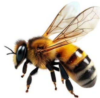
honeybee ( Apis mellifera )